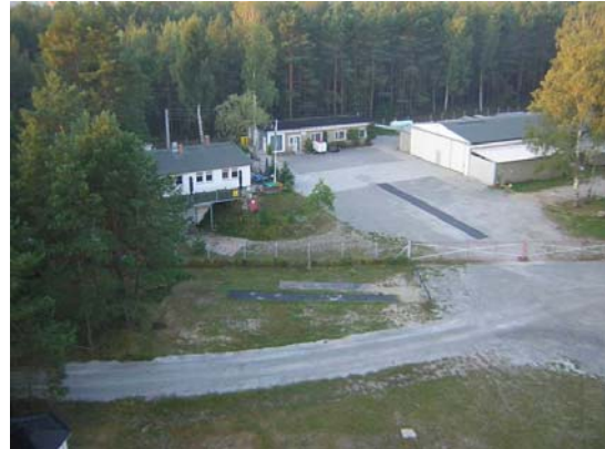
View of the airfield from eastern direction

Clubhouse, Hangars and sanitary facilities